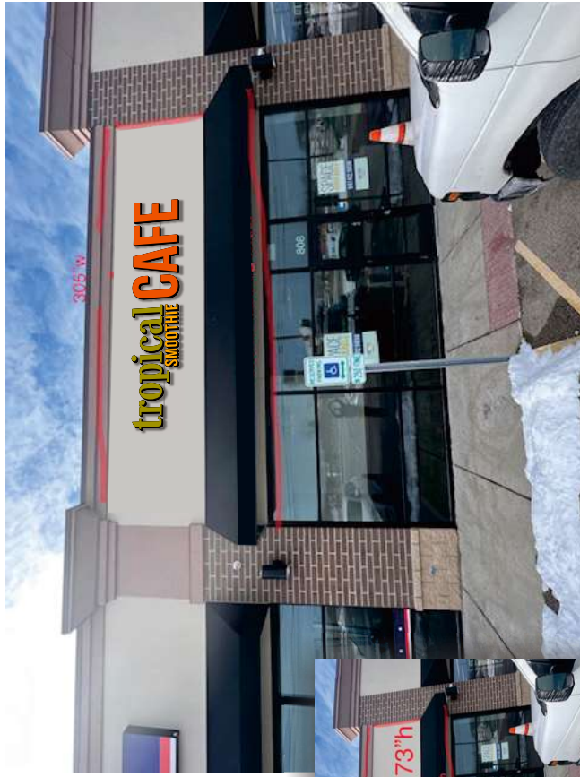
Existing shop front